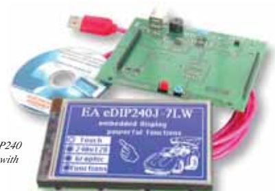
EA START-eDIP240 Starter Kit USB with simulator

7 built-in fonts in different sizes (see picture below). All the character sets can be enlarged up to 4 times to their original size. A command allows you to rotate them by 90° for vertical presentation. All character sets can be re-defined by a powerful FontEditor tool. Individual character sets may be added easily.